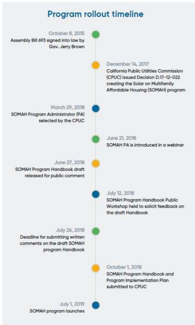
Figure 2 SOMAH Program Rollout Timeline

program to distinguish it from other state clean energy and low-income solar programs. Decision 17-12-022 established the program’s budget, incentive structure and eligibility policies, among other items.