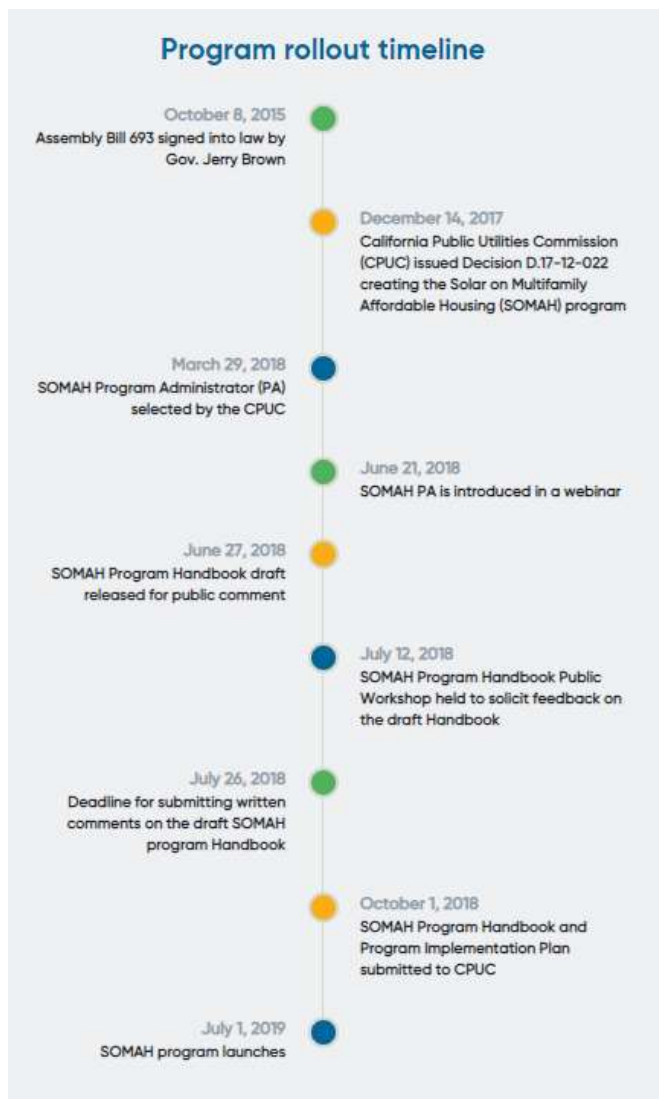
Figure 2 SOMAH Program Rollout Timeline

program to distinguish it from other state clean energy and low-income solar programs. Decision 17-12-022 established the program’s budget, incentive structure and eligibility policies, among other items.