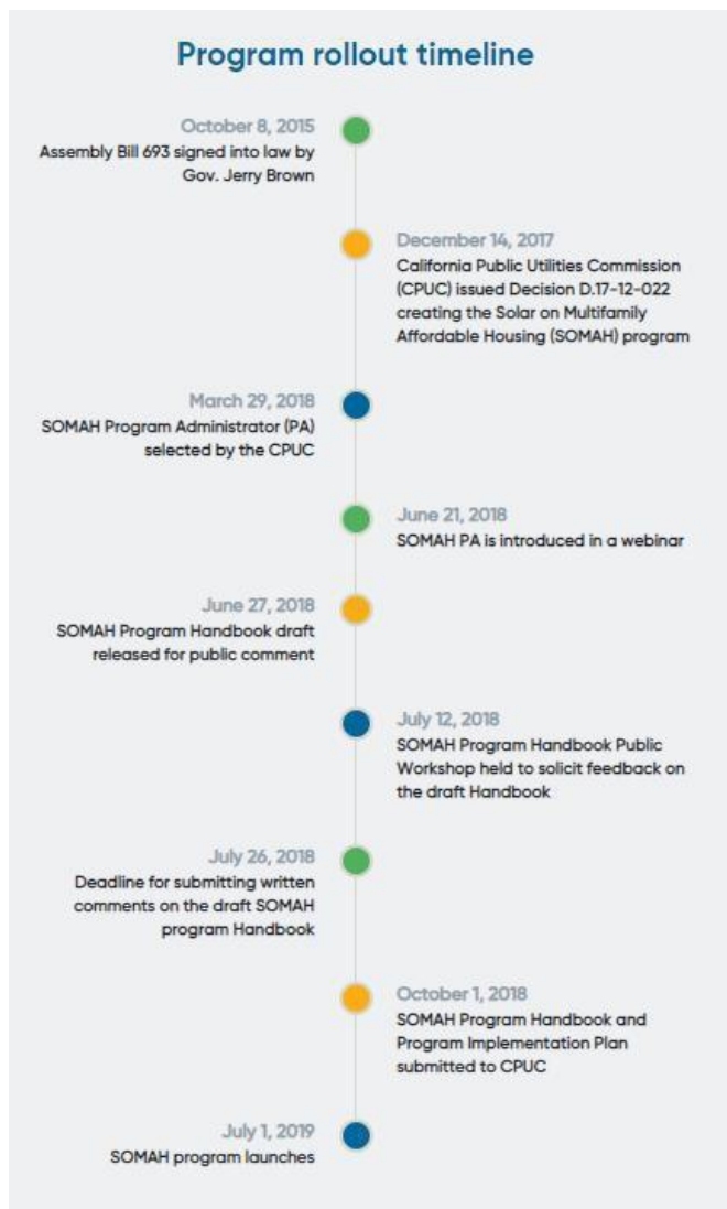
Figure 2 SOMAH Program Rollout Timeline

program to distinguish it from other state clean energy and low-income solar programs. Decision 17-12-022 established the program's budget, incentive structure and eligibility policies, among other items.